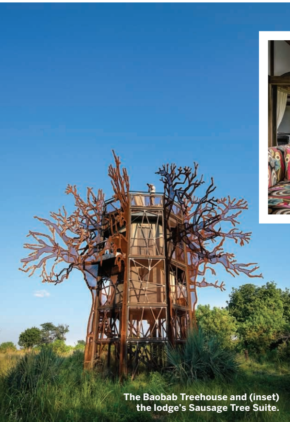
The Baobab Treehouse and (inset) the lodge's Sausage Tree Suite.